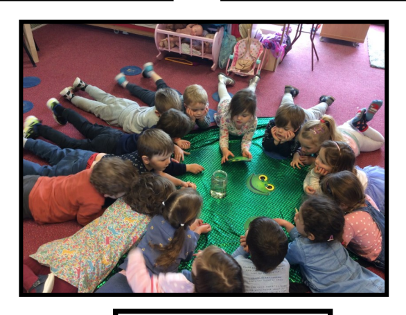
Looking at how our tadpoles are growing