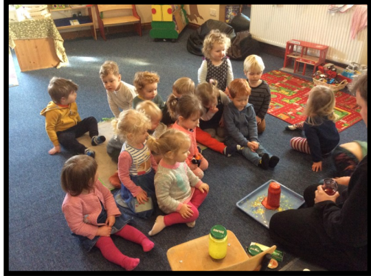
Making Lava Lamps.