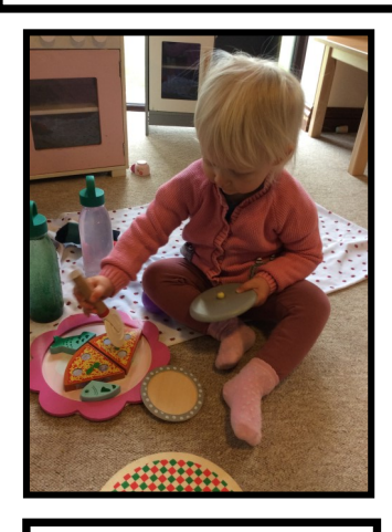
Role Play in Home Corner