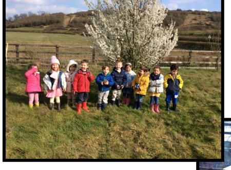
Going on a nature walk in the meadow

Making hobby horses for Jack & the Beanstalk