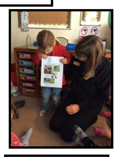
My pets at home.