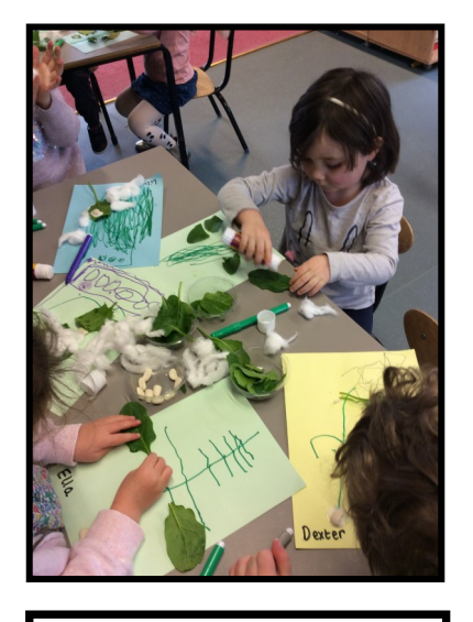
Creating a Beanstalk for Jack & the beanstalk