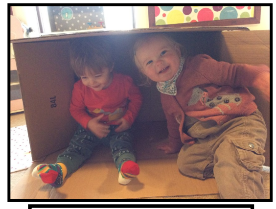
Cardboard Play fun