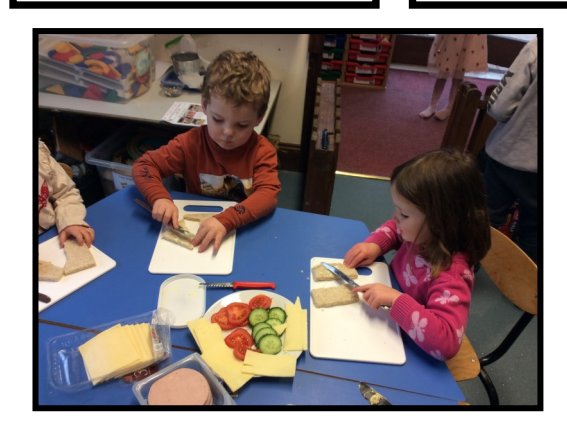
Learning about shapes by making shape sandwiches