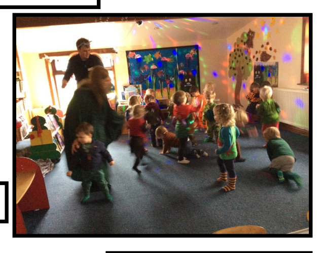
World Book Day Disco.