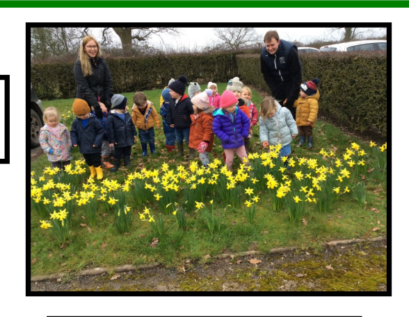
Admiring the beautiful Daffodils.