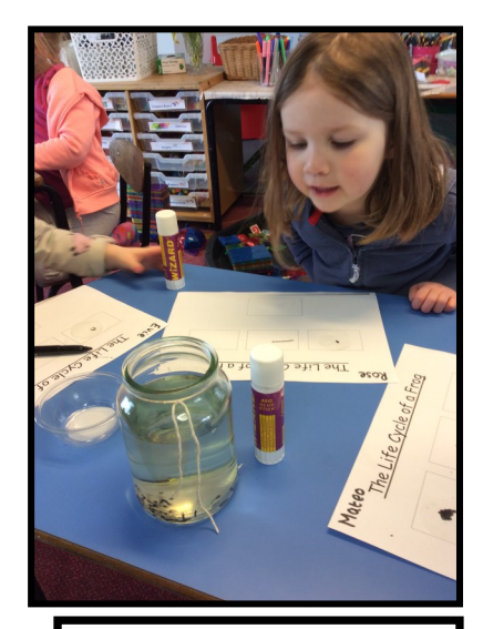
Learning about the life cycle of a frog